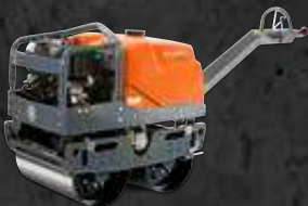
LP 6500 I

For complete range and technical specifications go to centerfold