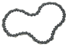
DIAMOND CHAINS ELITE-CHAIN™ C20

Coolant: Wet Cutting depth, max: 450 / 550 mm Bar length: 400 / 500 mm