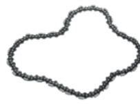
DIAMOND CHAINS ELITE-CHAIN™ C70

Coolant: Wet Cutting depth, max: 550 mm Bar length: 500 mm