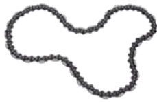
DIAMOND CHAINS ELITE-CHAIN™ C45

Coolant: Wet Cutting depth, max: 450 / 550 mm Bar length: 400 / 500 mm