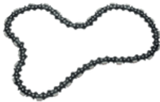
DIAMOND CHAINS VARI-CHAIN™ C45

Coolant: Wet Cutting depth, max: 450 mm Bar length: 400 mm