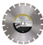
FLOOR SAW BLADES ELITE-CUT™ S85

Diameter mm: 500/-/800mm Arbor diameter: 25.4 mm