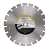
POWER CUTTER BLADES ELITE-CUT™ S85

Diameter mm: 450 / 500 / 600 mm Segment height mm: 12 mm Arbor diameter: 25.4 mm