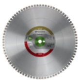
FLOOR SAW BLADES ELITE-CUT™ F620

Diameter mm: 500/-/800mm Arbor diameter: 25.4 mm