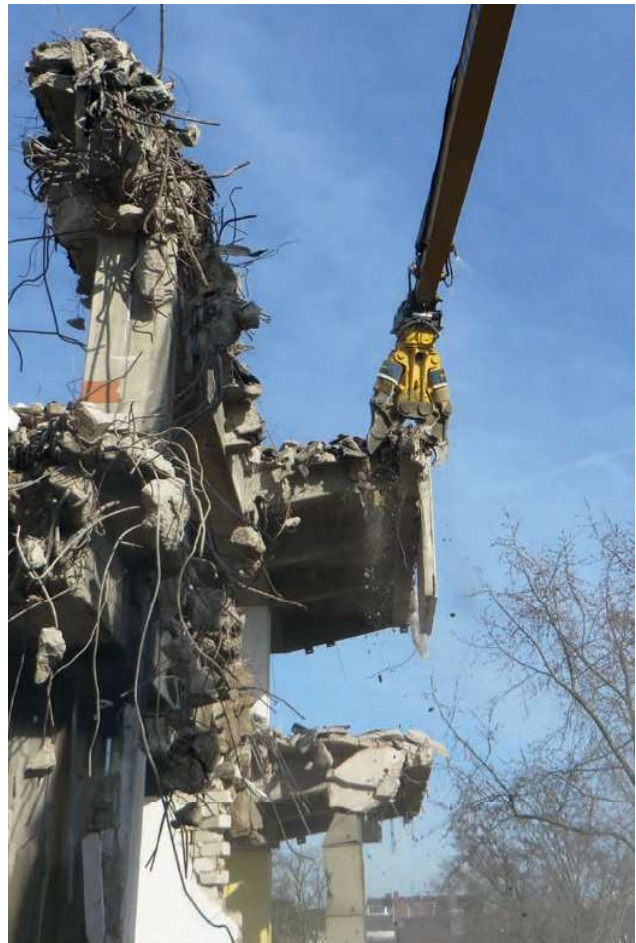
The lightweight Concrete Busters are ideal for high reach deconstruction. Perfect for demolition sites in residential areas.